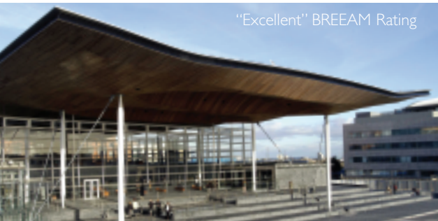
"Excellent" BREEAM Rating

Visit our website www.systemuvex.co.uk to learn more about our unique water management solution.